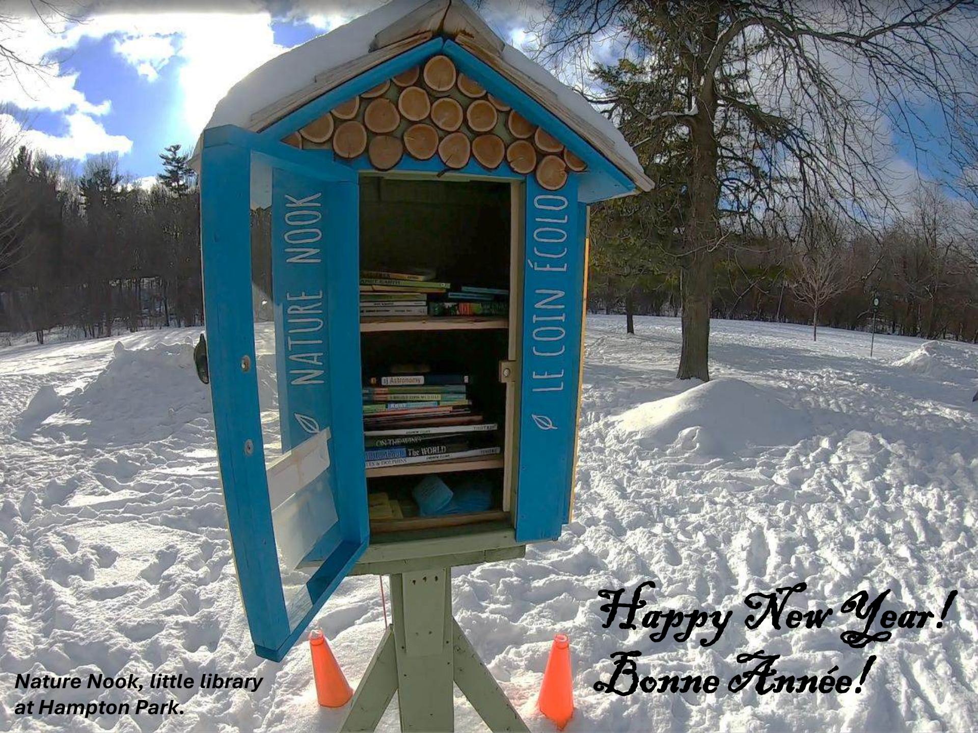
Nature Nook, little library at Hampton Park.