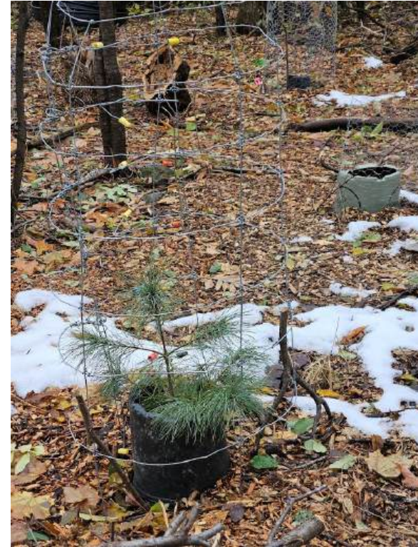
Eastern white pine. One of the 10 trees donated by Canadensis for planting in Carlington and Hampton.

canadensis The Garden of Canada Le Jardin du Canada