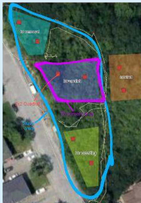
Aerial of treatment areas. Control area where no intervention has been taken is in orange.

We were thrilled to meet a couple of local scientists earlier this year who have done a lot of this type of invasive work before. Ravi, pictured above with Nora Lee, helped us set up a system to monitor different types of buckthorn control in 2025.