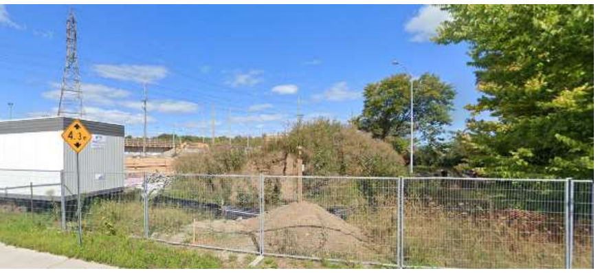
September 2019 Construction finished that year and trees were planted in 2020.

If you want to arrange your own clean up here, go for it! Contact <u>CarlingtonHampton@gmail.com</u> if you need extra bags, litter grabbers, or buckets. We can also call the City for the pick up on your behalf.