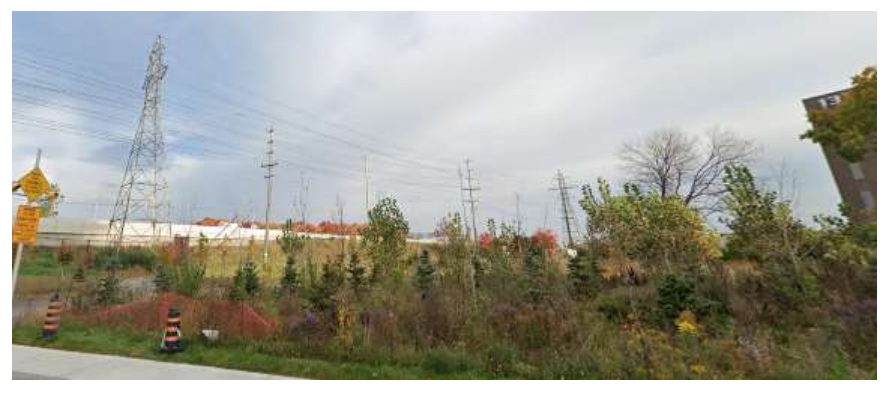
June 2023. Many deciduous trees planted are dead, or won't survive, but all of the evergreens appear to be healthy.