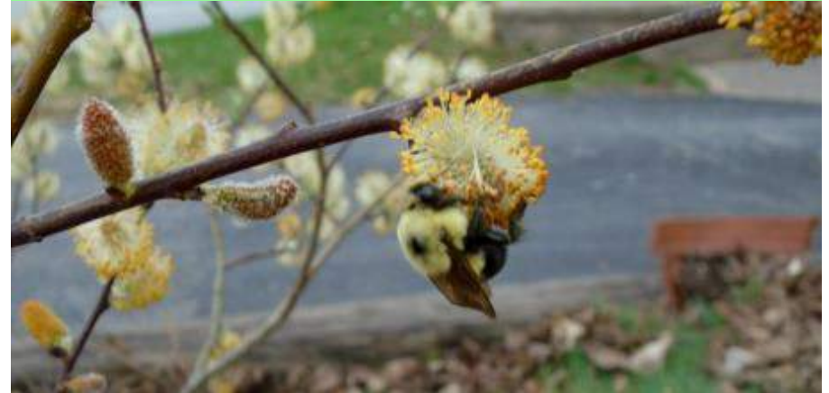
Bumble bee takes advantage of a flowering pussy willow shrub in early May 2022.

https://savvygardening.com/spring-garden-clean-done-right/